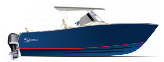
THE UNSTOPPABLE THEME