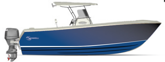
THE UNSTOPPABLE THEME